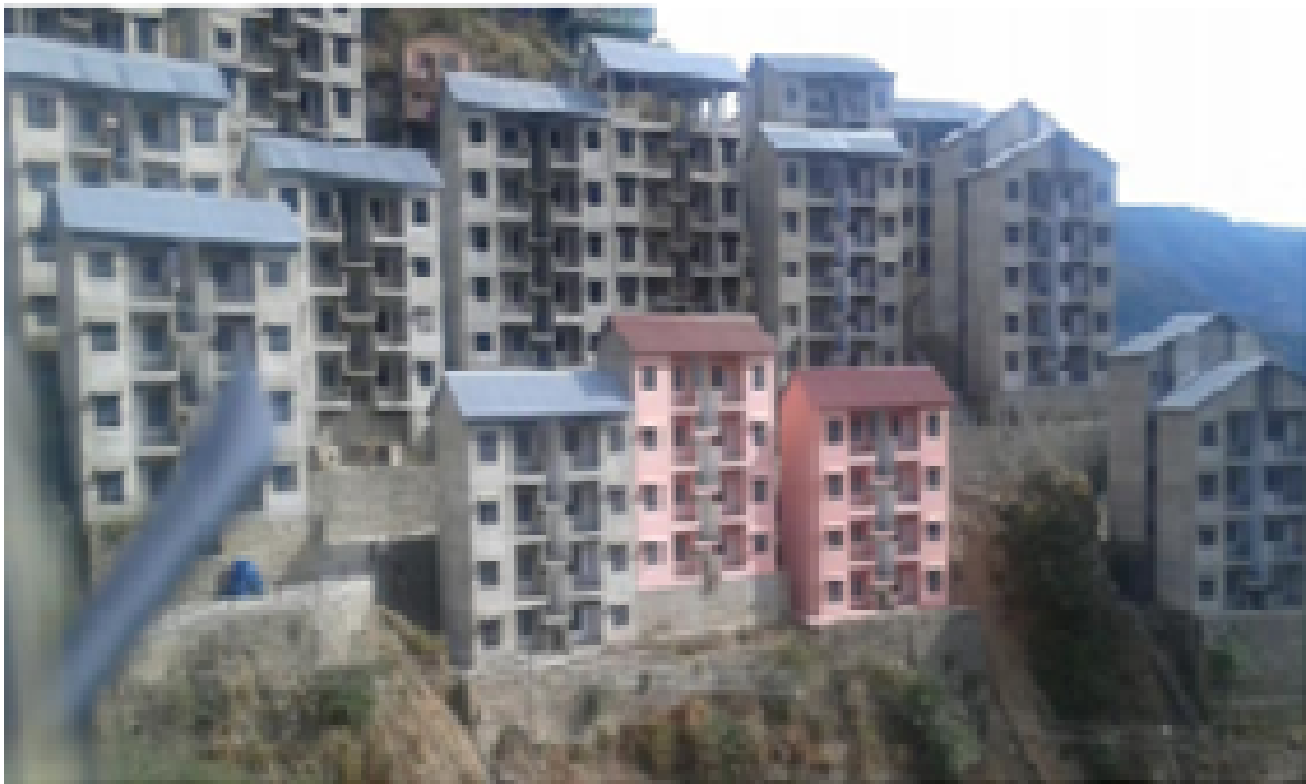
Houses under Ashiana - II, Dhalli, Shimla

In second phase 93 applications have been received for the allotment of houses .